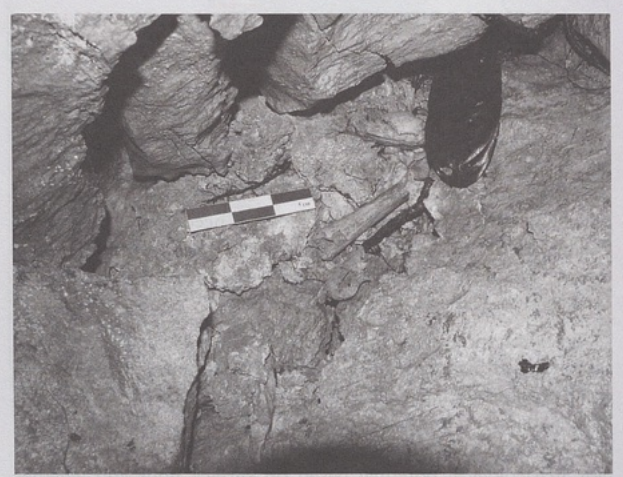
Fig. 2: Human bones found at Rockshelter 2, Sungai Payau.

Rockshelter 1 (N 04° 01' 27.4", E 114° 49' 19.0", 30 m above sea level) is located about 30 minutes on foot from the main office of Gunung Mulu National Park (Fig. 1). The rockshelter is 9.29 m